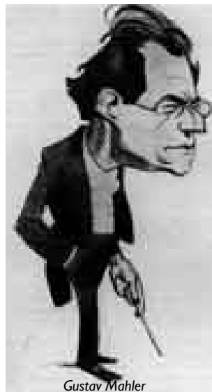
Gustav Mahler Caricature by Oscar Garvens